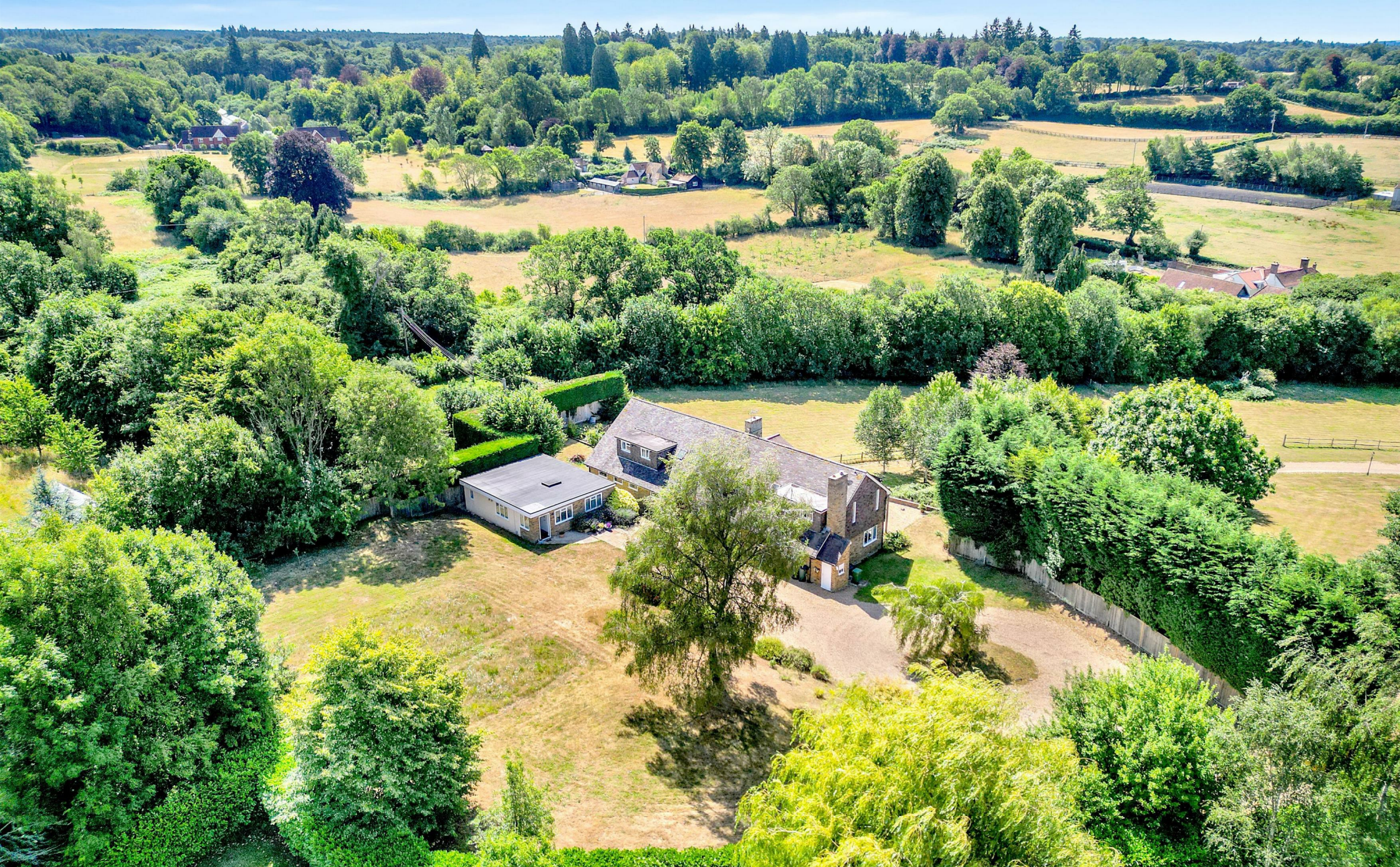
Horseshoe Farmhouse, Picketts Hill, Headley, Hampshire GU35 8TD.